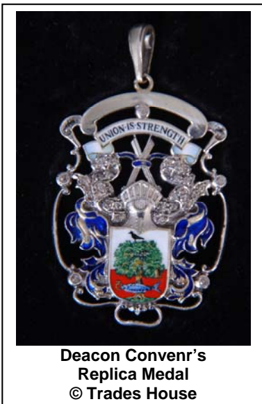
Deacon Convener's Replica Medal