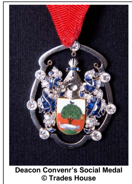
Deacon Convener's Social Medal

representing the House at social or other gatherings. It is in the form of a platinum medal with gold back, containing seven large diamonds on the platinum border, the centre consisting of the Trades House Coat of Arms highly enamelled, with the House Crest, the whole being done in thirty small diamonds and thirty four sapphires. The inscription on the back is: "Gifted by the Incorporation of Tailors in Glasgow to the Trades House of Glasgow, 12 July, 1926".