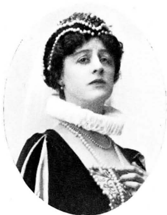
MARIE Queen of Scots Scottish National Exhibition Glasgow