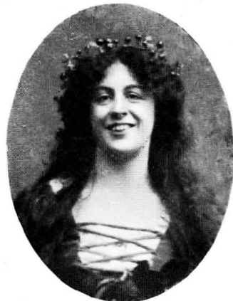
LADY BABBIE "The Little Minister" King's Theatre Kilmarnock