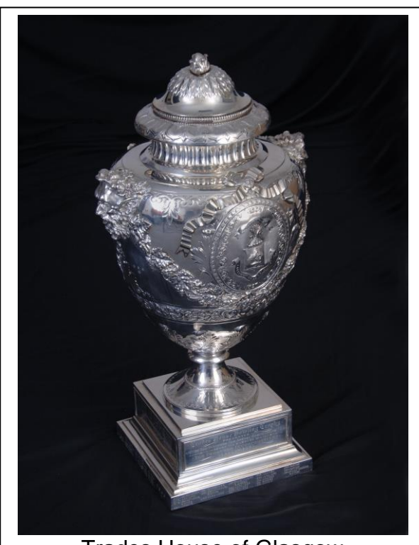
Trades House of Glasgow Bowling Trophy Presented 1897

http://www.tradeshouselibrary.org/uploads/4/7/7/2/47723681/criminal_reports_in_glasgow ~ final_small.pdf