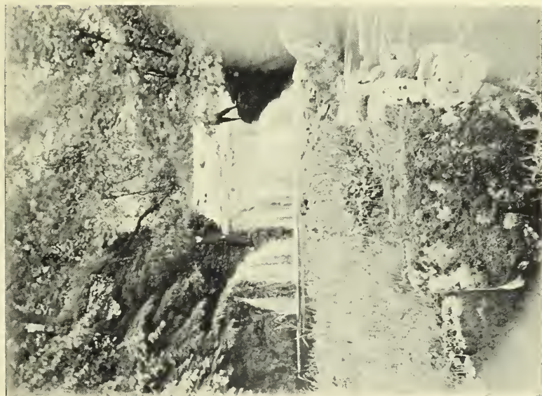
KILMINNING LINN AND FALLS, MIDGE GLEN.