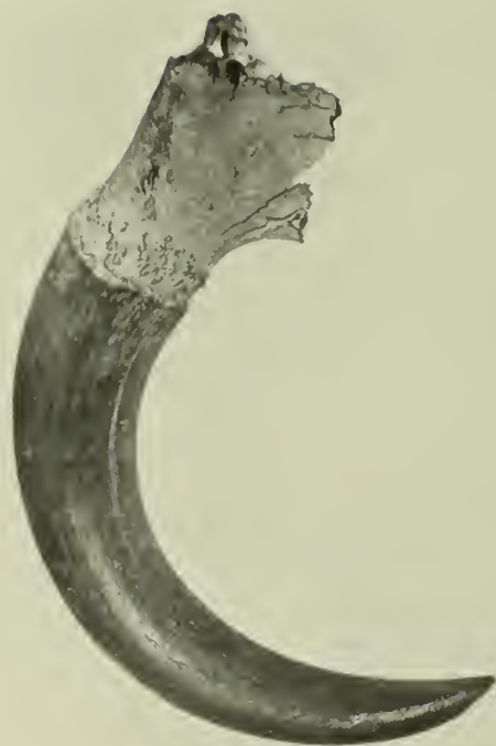
HORN AND UPPER PART OF SKULL OF Bos PRIMIGENIUS , FOUND IN INTERGLACIAL BEDS IN COWDEN GLEN, NEILSTON.