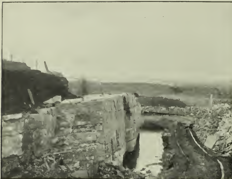
THE WORKING FACE OF THE GLACIATED LIME-STONE WHICH SHOWS THE STRIATED SURFACE IN LUGTON QUARRY.