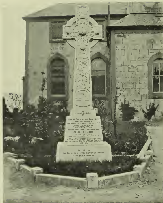
SOUTH AFRICAN VOLUNTEERS' MEMORIAL CROSS AND PART OF NEILSTON CHURCH AND VESTRY.