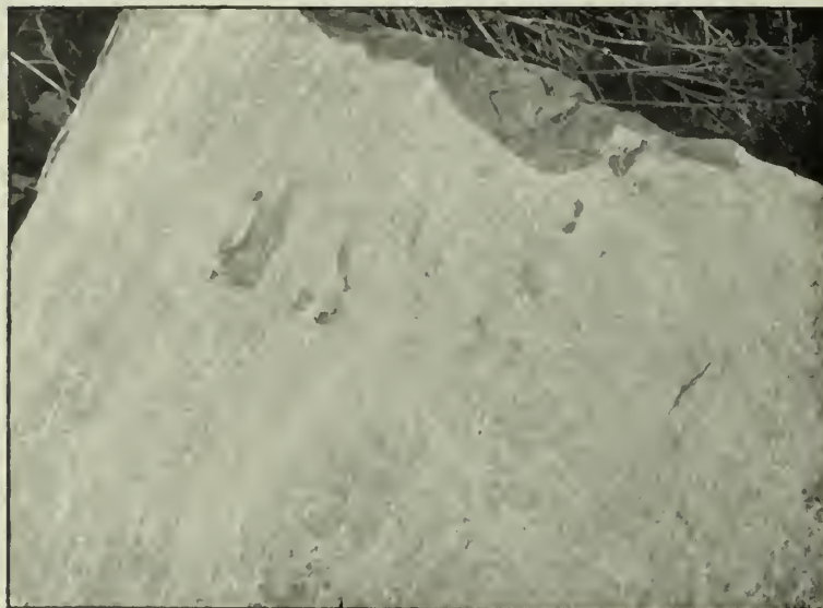
A SECTION OF THE GLACIALLY STRIATED SURFACE OF LIME-STONE, LUGTON.