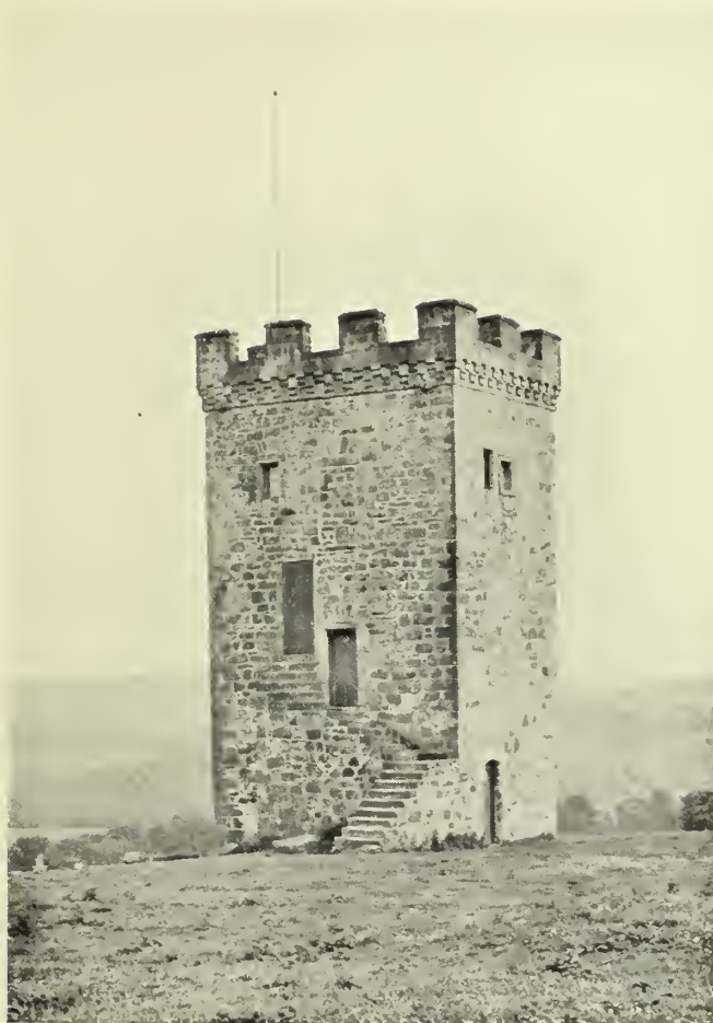
CALDWELL PLACE TOWER