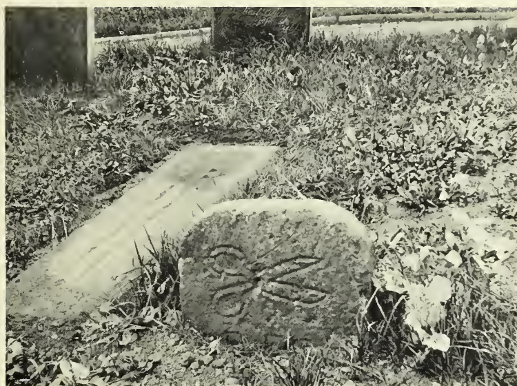
STONES IN NEILSTON CHURCHYARD.