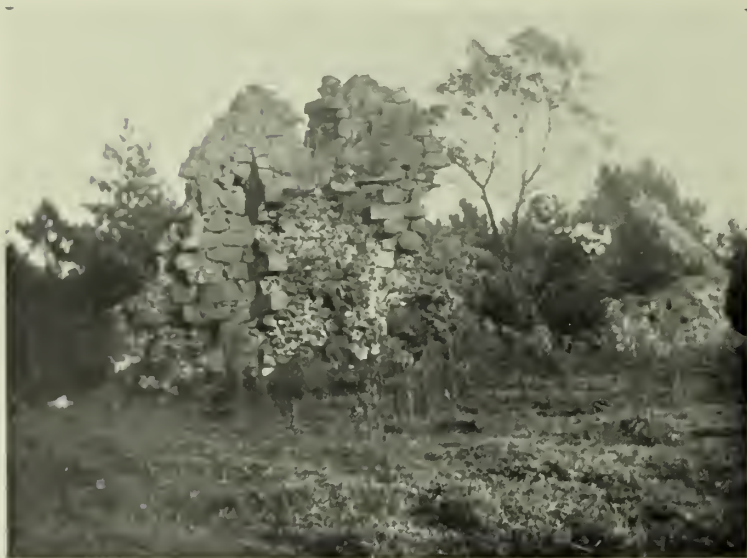
RUINS OF COWDEN HA', NEILSTON.