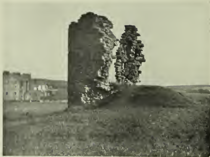
RUINS OF STEWART RAISS, DOVECOTHALL, BARRHEAD.