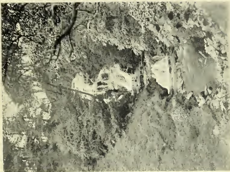
PART OF KILLOCH GLEN.