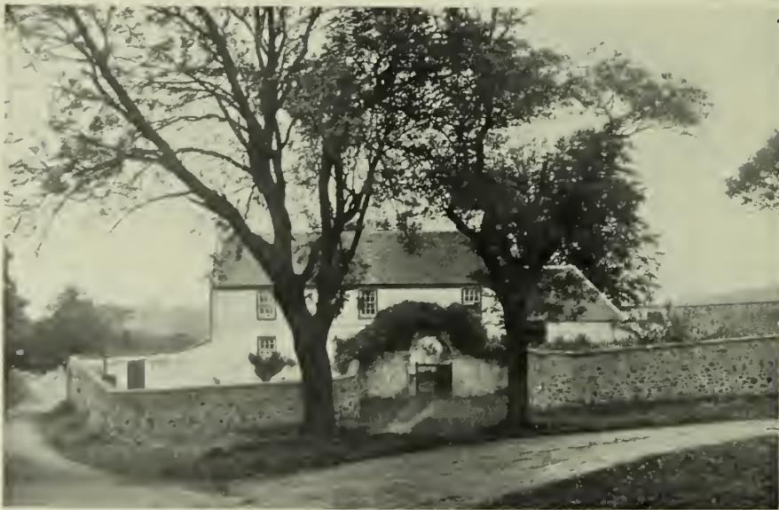
OLD HALL OF CALDWELL BEFORE RECENT ALTERATIONS.