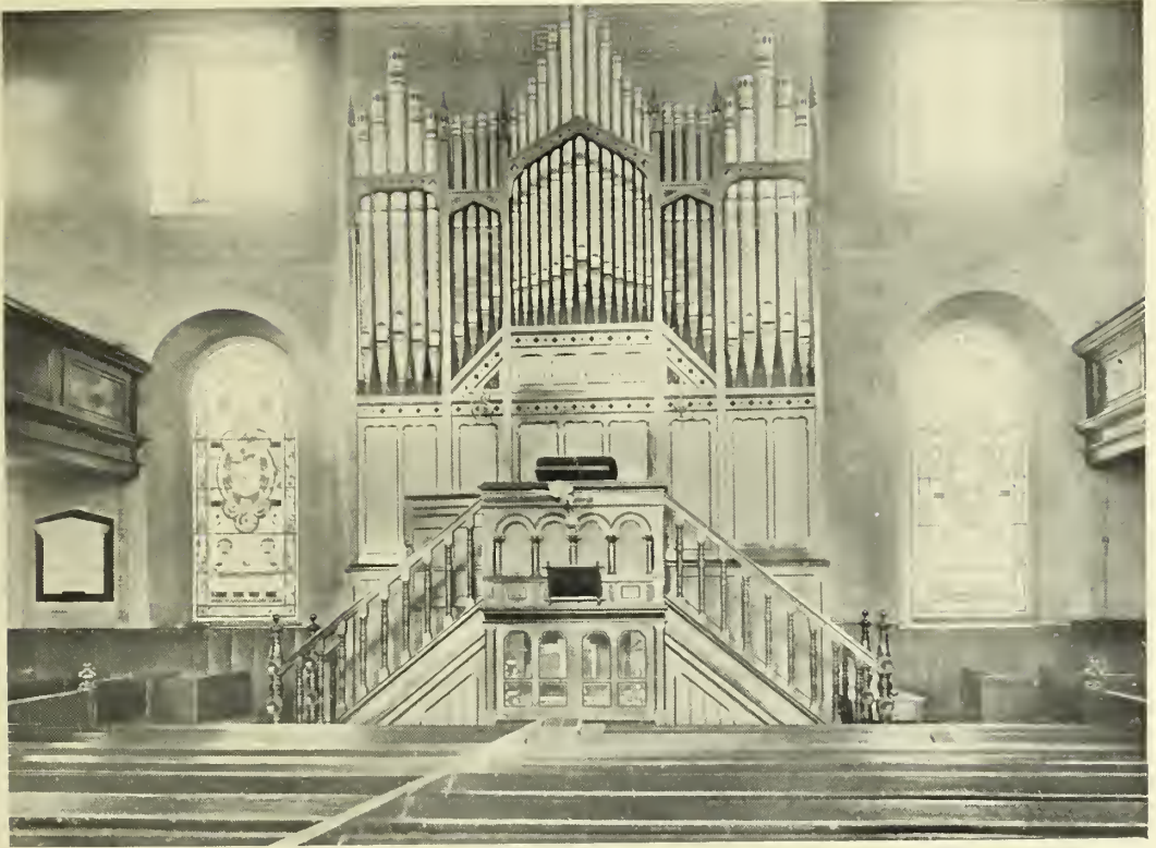
INTERIOR OF NEILSTON PARISH CHURCH.