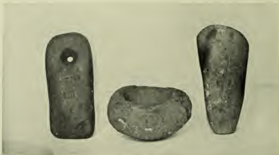
1. SINKER OR WHETSTONE.