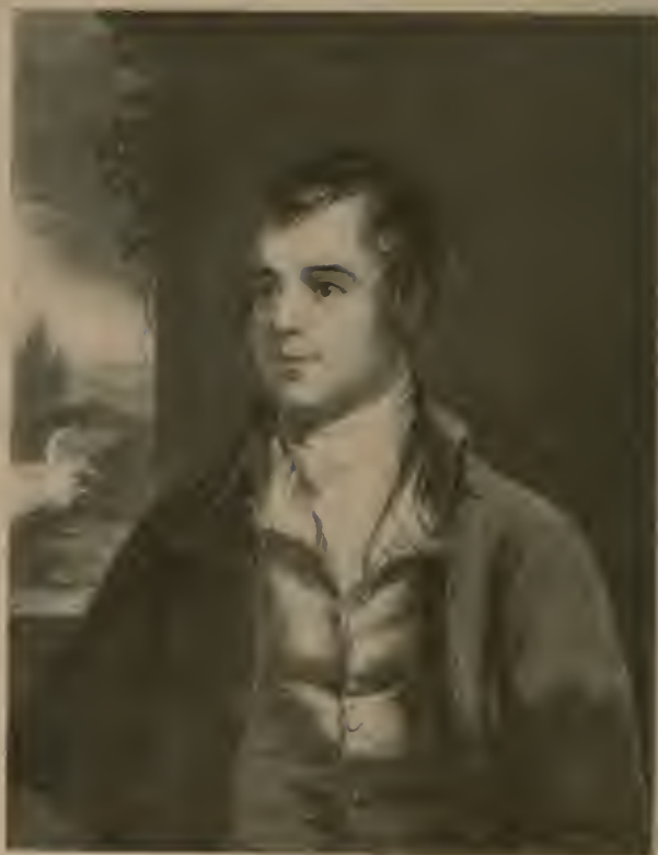
The Nasmyth Portrait of ROBERT BURNS