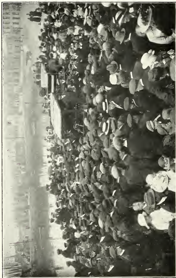
Sunday, 2nd August 1914. —The first of the Naval Reserve men leave Macduff at 2 p.m. by motor cars for Aberdeen en route for Portsmouth.