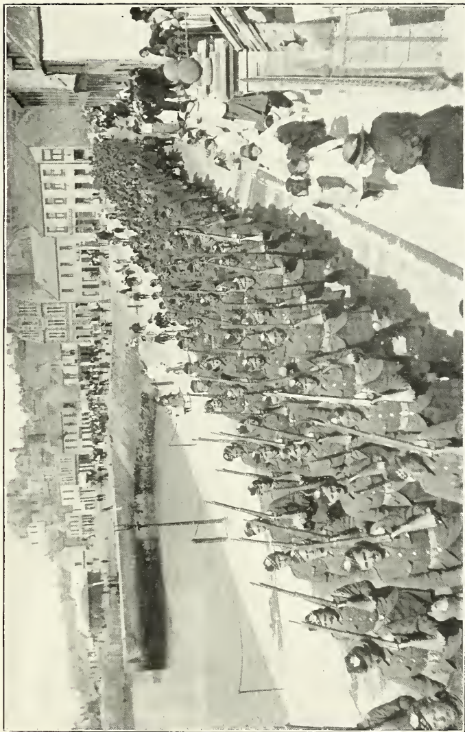
June 1915.—6th Battalion Gordon Highlanders, 600 strong, visits Macduff.