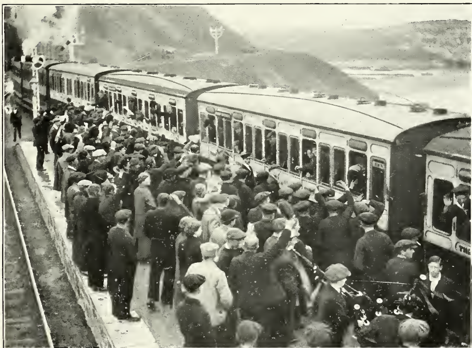
Monday, 3rd August 1914. —A second draft of Naval Reserve men leaves Macduff for Portsmouth.