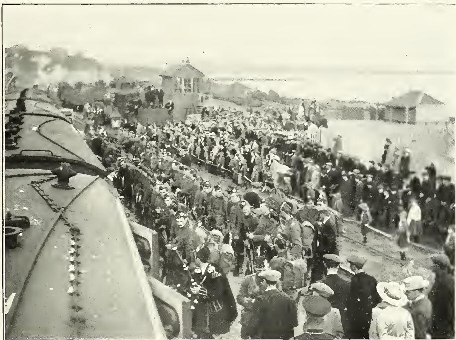
7th August 1914. —6th Batt. Gordon Highlanders entraining at Banff Harbour Station for Keith.