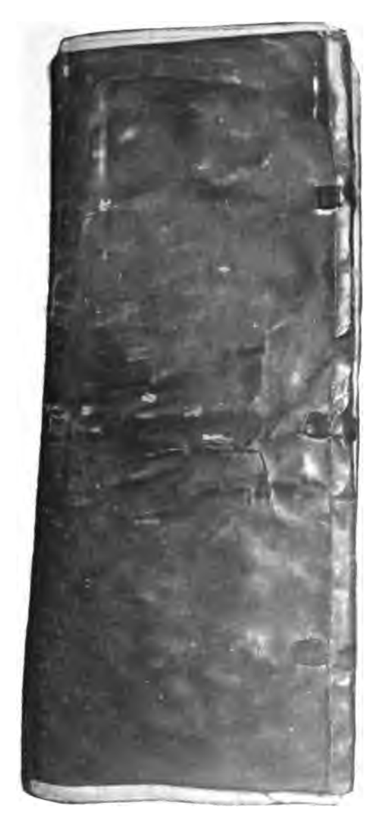
THE FIRST MINUTE BOOK.