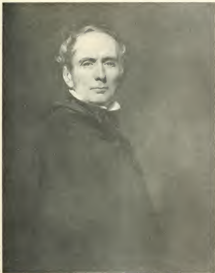
SIR J. WATSON GORDON.