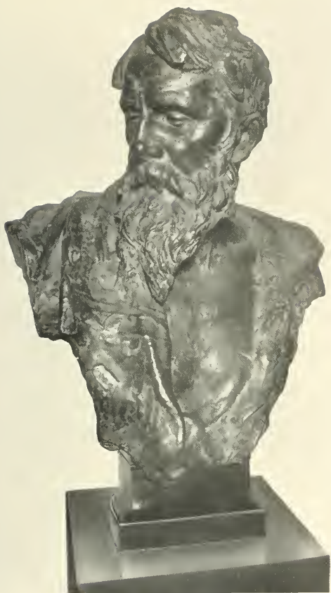
SIR GEORGE REID.