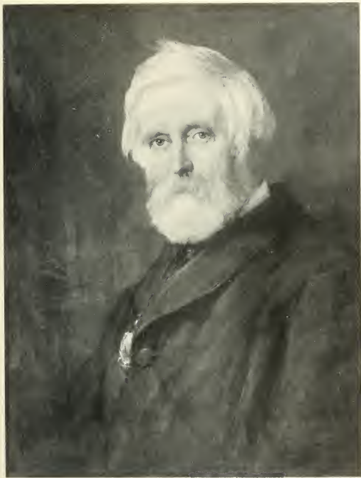
SIR WILLIAM FETTES DOUGLAS.