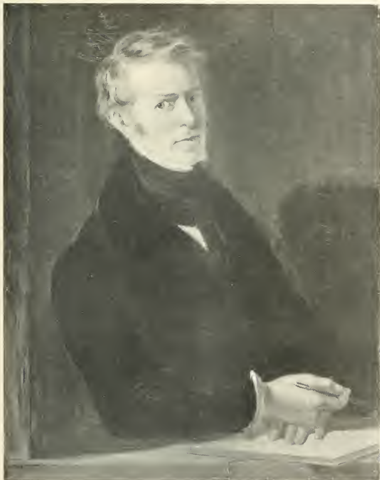
SIR WILLIAM ALLAN.