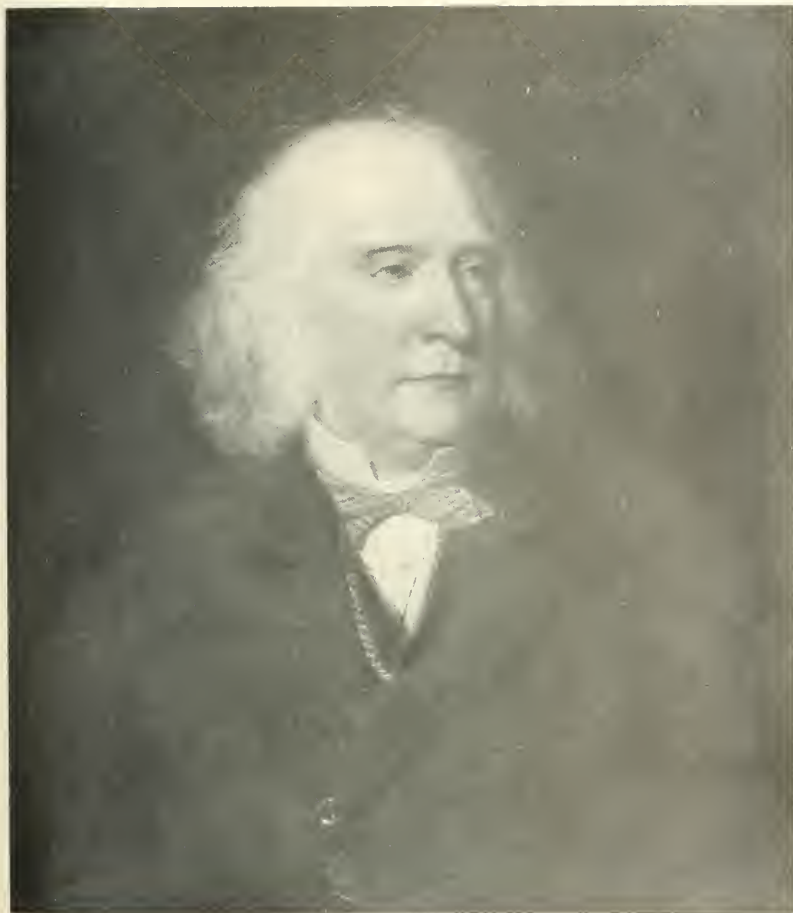
SIR GEORGE HARVEY.