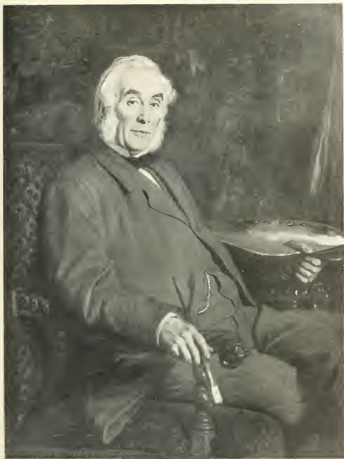
SIR DANIEL MACNEE.