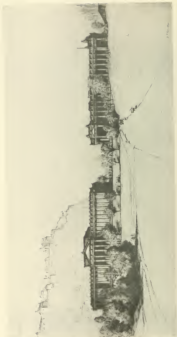
ROYAL SCOTTISH ACADEMY, EDINBURGH.